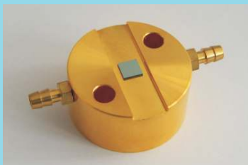
soldered chip on water cooled mount with 25.0mm diameter

or thin film soldered on a water cooled gold plated copper mount with 25.0mm diameter