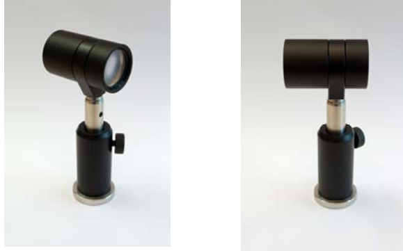
Fig. 6: CTL-D25mm and FTL-f30mm mounted with SMR1

An additional second TPX lens FTL-f30mm with 30 mm focus length can be mounted on the CTLF-25mm to get a THz focus. Please refer to data sheet for FTL-f30mm for further information.