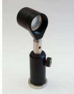
CTL-D25mm mounted with SMR1