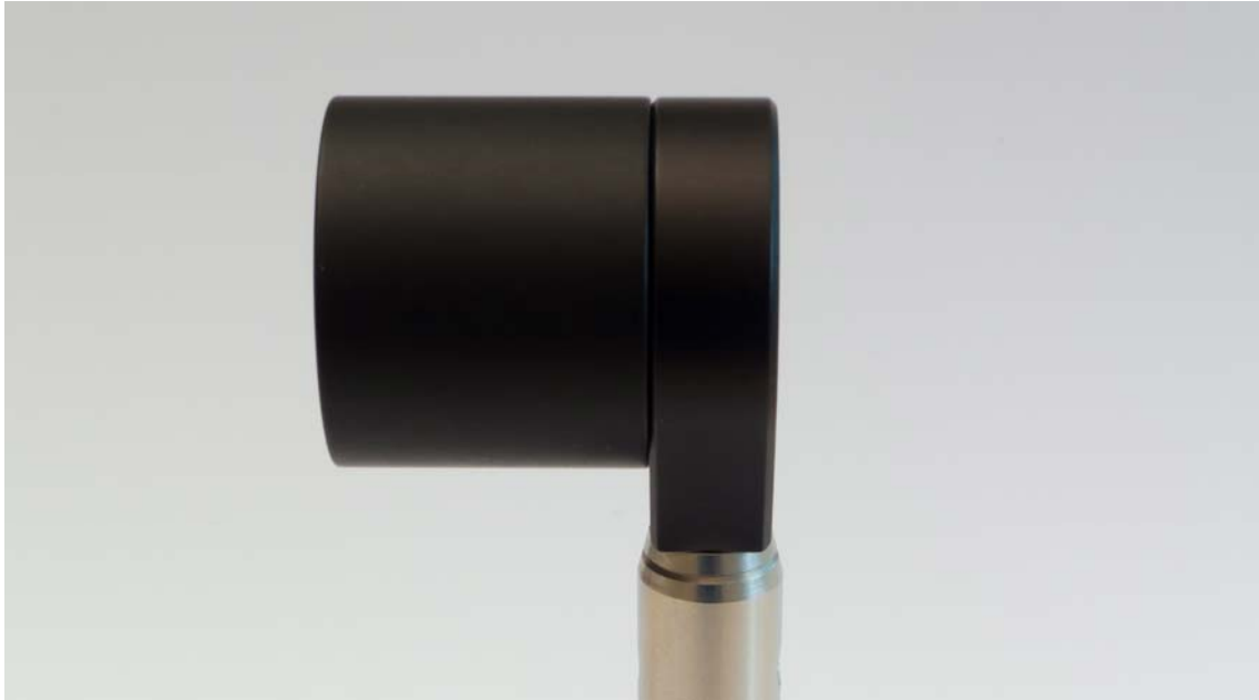
Fig. 2_CTL-D25mm mounted on SMR1 - side view

needs to be equipped with one of BATOP's hyperhemispherical silicon substrate lenses.