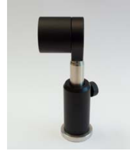
CTL-D25mm mounted with SMR1