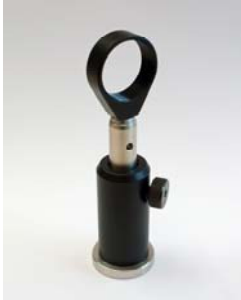
SMR1 with pillar and post holder

The Lens Tube's SM1 thread allows it to be attached to multiple standard parts equipped with the same thread. It is possible to mount both lens and PCA either with the tube's thread oriented towards the front side, where the radiation is emitted or received, or towards the back side, where fiber and electrical cables exit the antenna module. We recommend using Thorlab's SMR1 as a static mounting solution. CTL-D25mm is compatible to PCAs with mounted aspheric optical lenses. In this case a larger lens tube is required and the length will increase to 2".