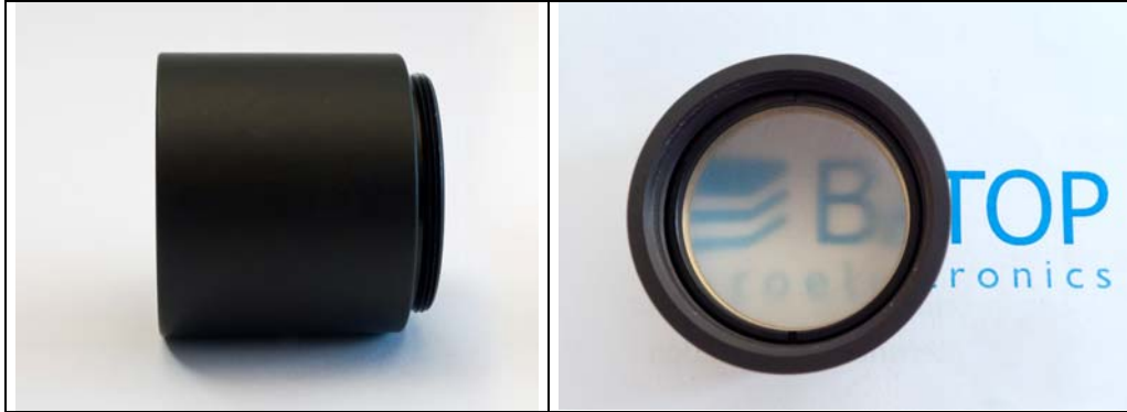
Fig. 1: CTL-D25mm