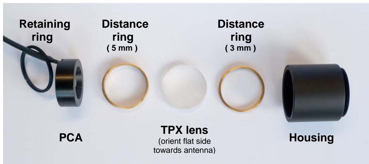
Fig. 5: Order of components of CTL-D25mm

When you purchase CTL-D25mm separately you'll need to assemble it on your own. The following photo shows you how. You'll start inserting the thinner distance ring into the lens tube. Afterwards you insert the lens and a second, thicker distance ring. Make sure that the lens is oriented with its flat side towards the antenna. Then you insert your PCA. At last you fix the all components by screwing in the retaining ring. Its external thread matches the internal thread of the lens tube. Therefore you'll need an additional tool, for example Thorlabs' SPW602 spanner wrench.