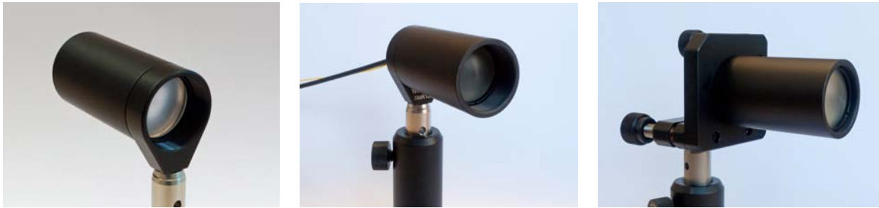
CTLF-D25mm mounted with SMR1 (front side threaded)

The Lens Tube's SM1 thread allows it to be attached to multiple standard parts equipped with the same thread. It is possible to mount both lens and FC-PCA either with the tube's thread oriented towards the front side, where the radiation is emitted or received, or towards the back side, where fiber and electrical cables exit the antenna module. We recommend using Thorlab's SMR1 as a static mounting solution. Tilting the antenna is possible when Thorlabs's KM100T is used.