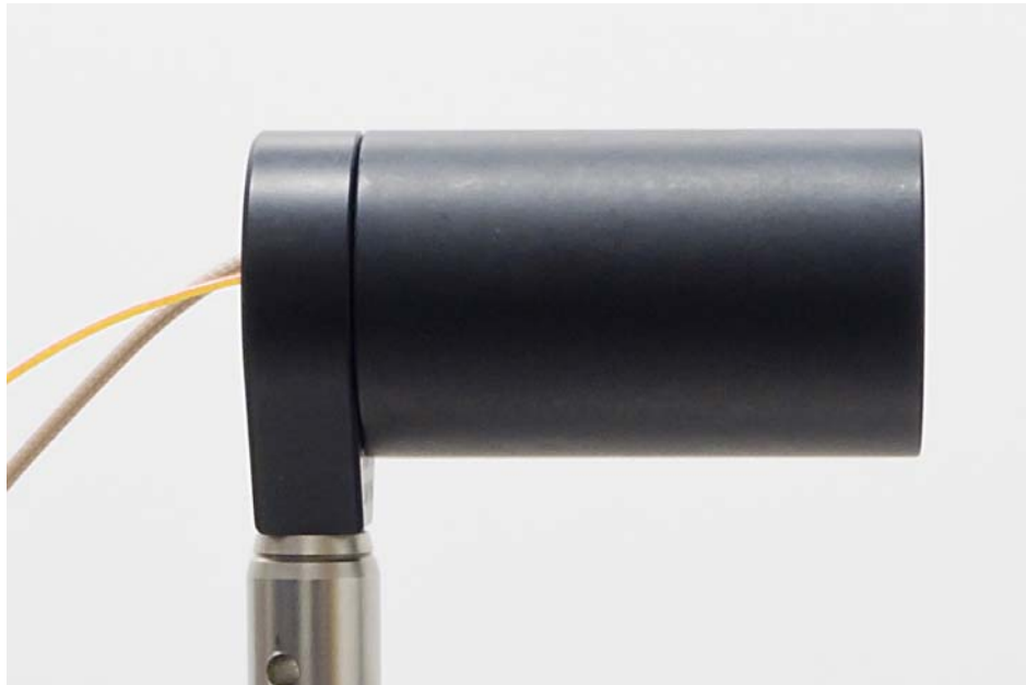
Fig. 2: CTLF-D25mm mounted on SMR1 - side view

needs to point towards the front side (laser or chip side) of the PCA. Further the PCA needs to be equipped with one of BATOP's hyperhemispherical silicon substrate lenses.