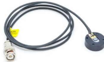
PCA – Photo Conductive Antenna

Photoconductive THz antenna for laser excitation wavelength \sim 800 nm and Parallel-line structure