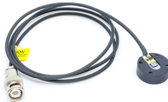
PCA – Photo Conductive Antenna

Photoconductive THz antenna for laser excitation wavelength ~ 800 nm and Butterfly structure